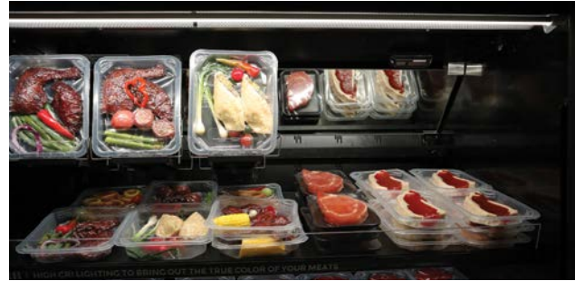
Optional Mirror or Product Pushers at the top of the case for merchandising.