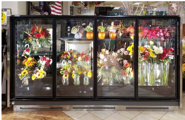
VNRBS case configuration with (2) 18" deep shelves is intended for non-critical temperature floral applications only.

Please consult Hillphoenix Engineering Reference Manual for dimensions, plan views and technical specifications. Specifications subject to change without notice. Designed for optimal performance in store environments where temperature and humidity do not exceed 75° F and 55% R.H. Certified to UL 471 and ANSI/NSF Standard 7.