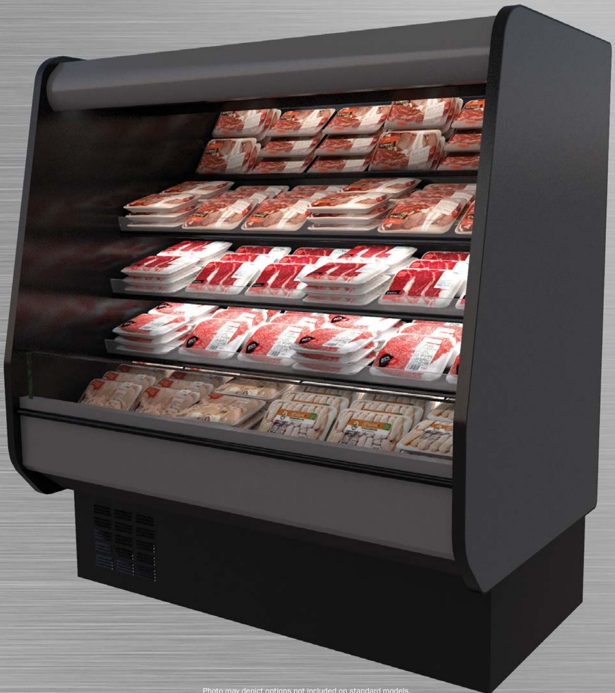
Photo may depict options not included on standard models.

Medium temperature spot merchandiser for meat and meal kits.