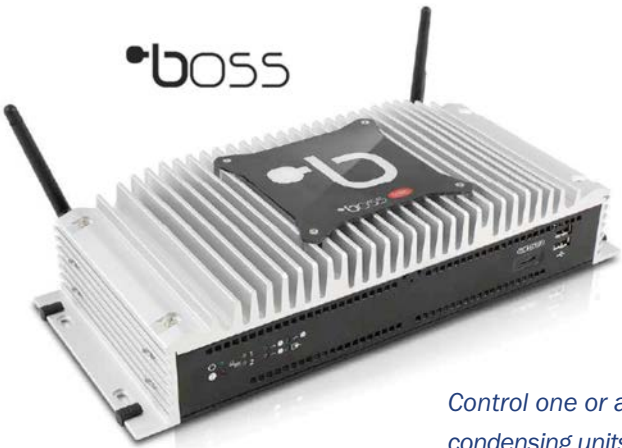
Control one or an entire network of condensing units with a BOSS controller.

Control one or an entire network of condensing units with a BOSS controller from Carel. Know exactly when it’s time for service with BOSS’s remote monitoring capabilities. Then take advantage of the redesigned panels on SoloChill for easy-access and connections that are conveniently external. The BOSS open back-net capabilities allows it to communicate with most building management systems (BMS). Opt for a wired computer connection or use a smartphone and an app over wi-fi and maintain complete control of all your cases from the palm of your hand.