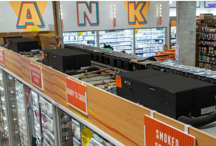
The key is a single, glycol-cooled condensing unit per case that can be mounted on top, beside or behind and completely out of a customer's sightline.

The key is a single, glycol-cooled condensing unit per case that can be mounted on top, beside or behind and completely out of a customer's sightline. Plus, their enclosures are designed without the need for fans making them quiet, with no fan noise to annoy shoppers. Add the units' low power requirements and SoloChill becomes an important part of any Hillphoenix full-store solution.