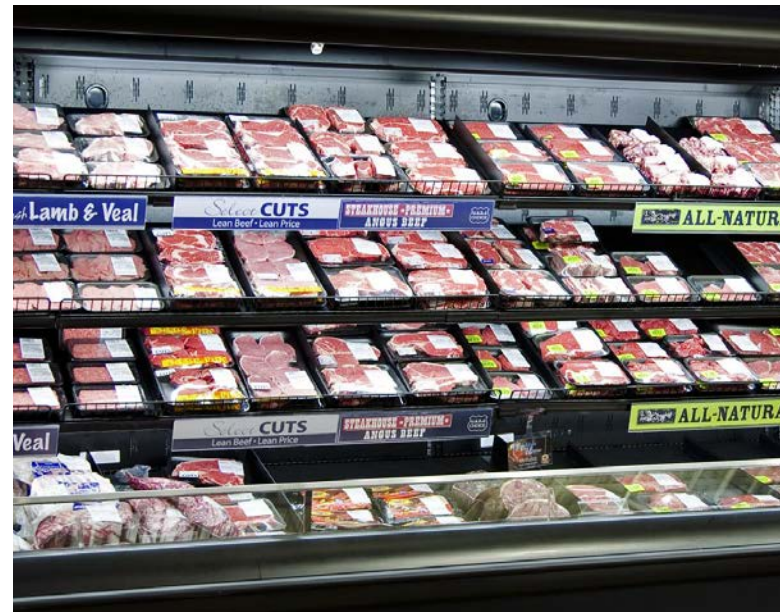
Wire Product Stop O5M Meat.