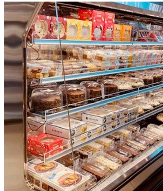
Plexi Product Stop O5DM Bakery.