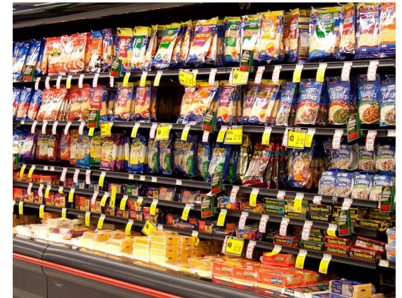
Peg Shelves O5DM Deli.